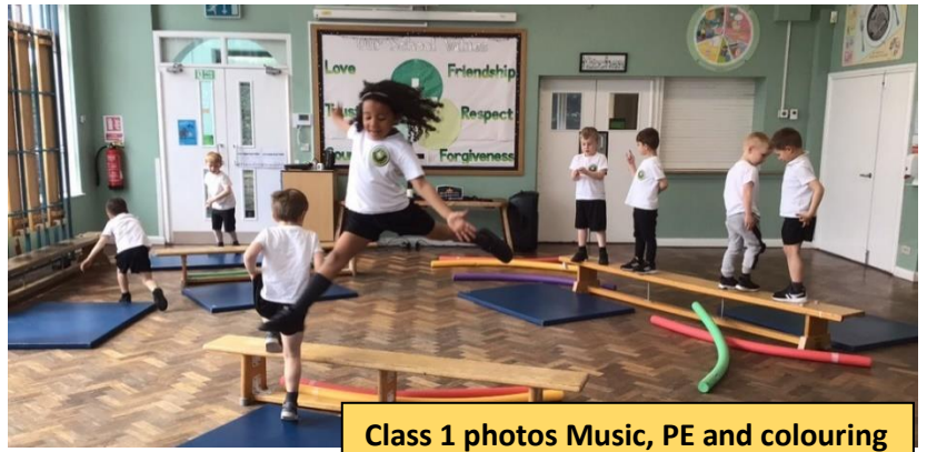
Class 1 photos Music, PE and colouring