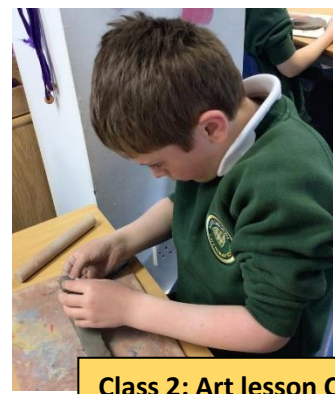
Class 2: Art lesson Clay