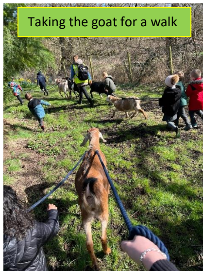
Taking the goat for a walk