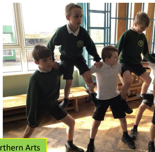
Class 3 Dance session with Northern Arts