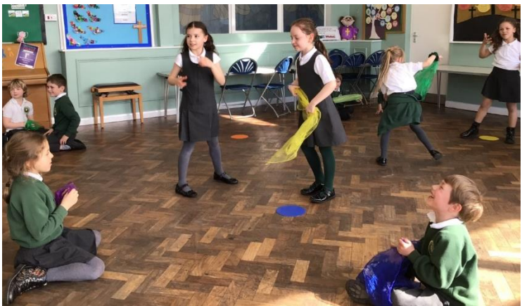
Class 2 Dance session with Northern Arts