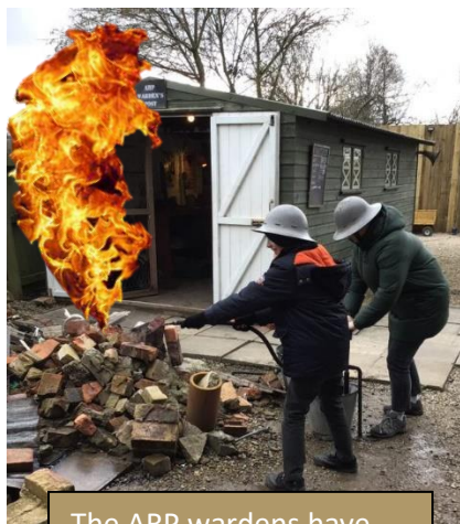
The ARP wardens have everything under control.