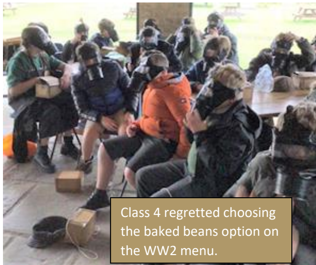
Class 4 regretted choosing the baked beans option on the WW2 menu.