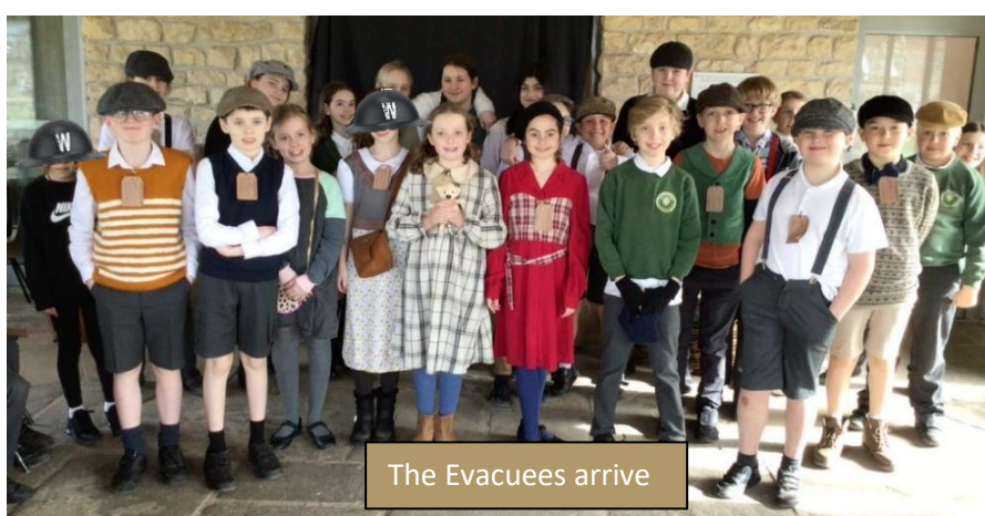
The Evacuees arrive