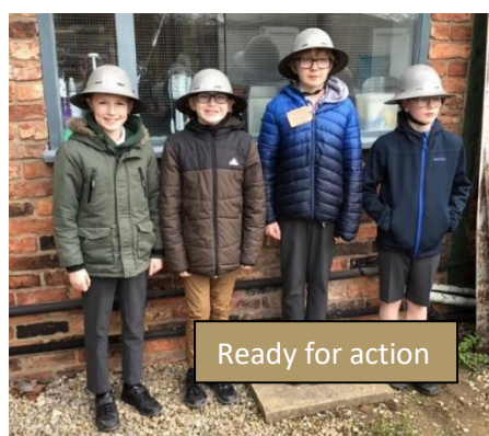
Ready for action