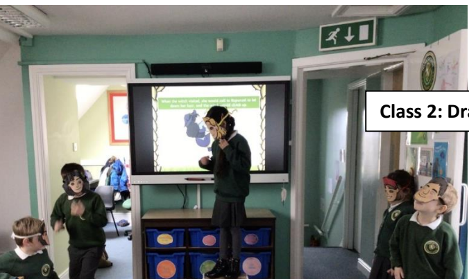
Class 2: Drama