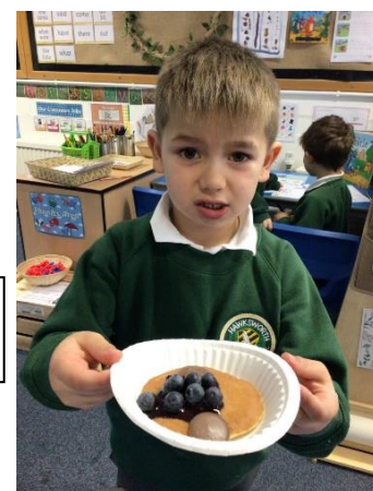
Class 1: Dragons, Pancake Day, outdoor learning and the mystery reader.