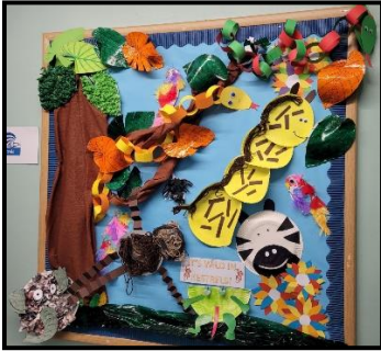
Kestrels Before and After School display board: Jungle Theme.