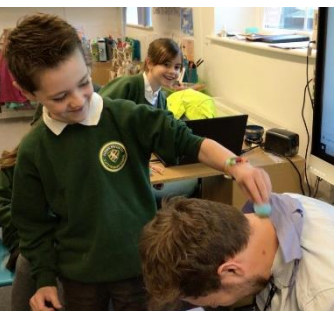
How to heal a wound in Ancient Rome