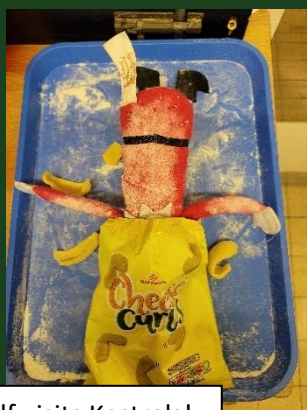
The Naughty Elf visits Kestrels!