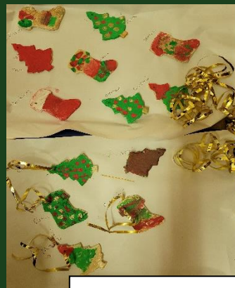
Kestrels Christmas Decorations