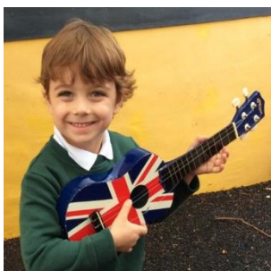
Class 1 enjoy their first week