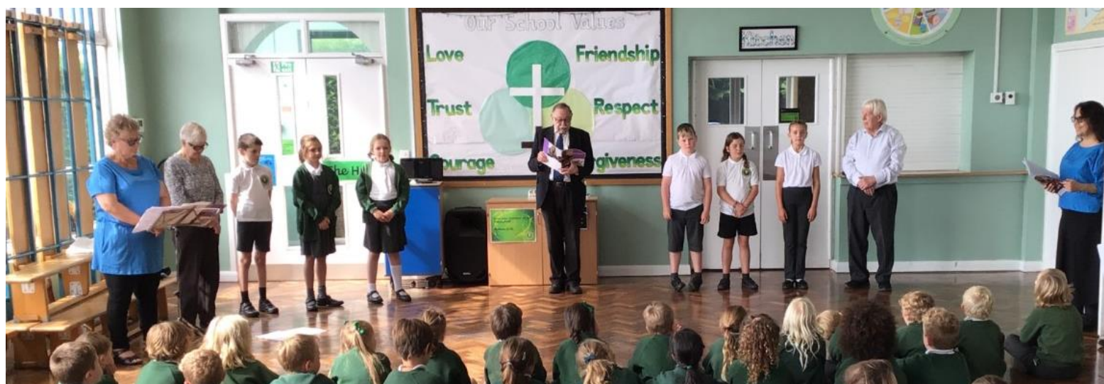
The 'Open the Book' team made a welcome return to Hawksworth and it was great to see them all after a two-year hiatus due to the pandemic. Even though they produced regular Open the Book videos for classes it is always better to see them live!