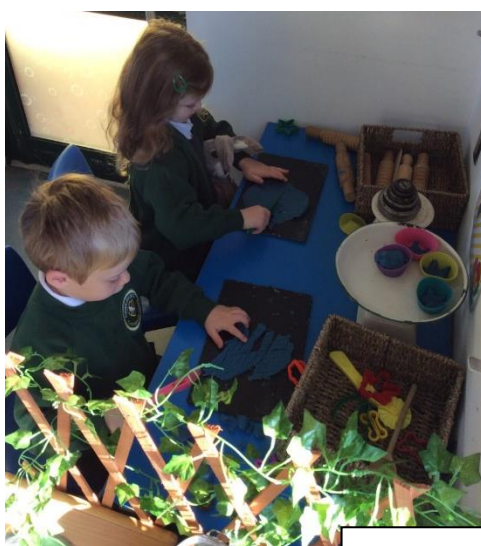
More Class 1 photos