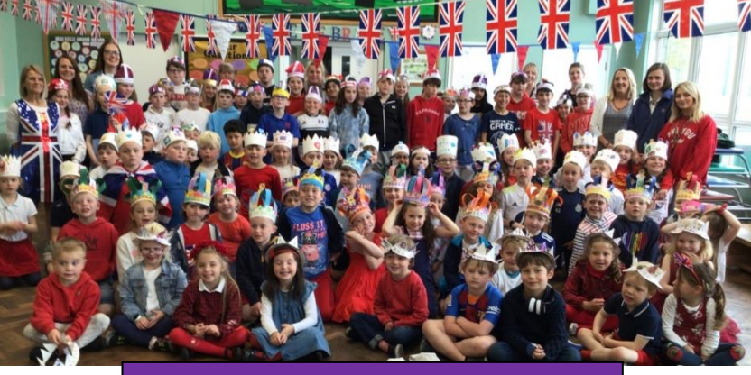
School celebrates the Queen's Jubilee