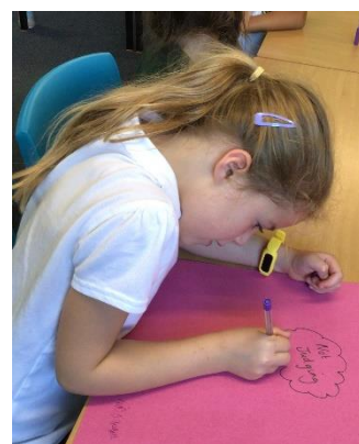
Class 3 PSHE – setting the ground rules