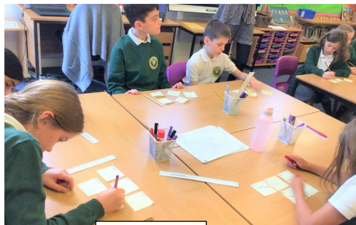
Class 4 Literacy