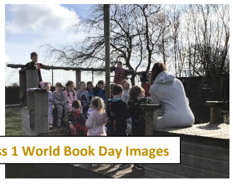
Class 1 World Book Day Images