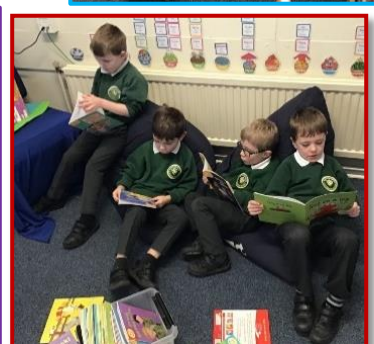
Class 1 Reading Workshop