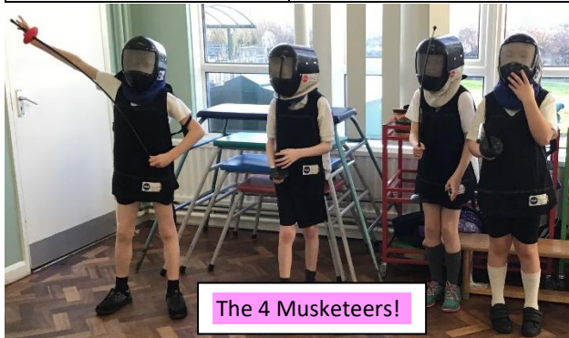
The 4 Musketeers!