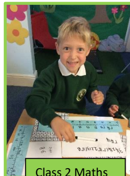
Class 2 Maths