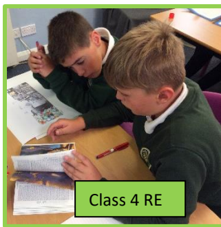
Class 4 RE