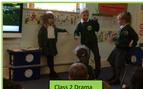
Class 2 Drama