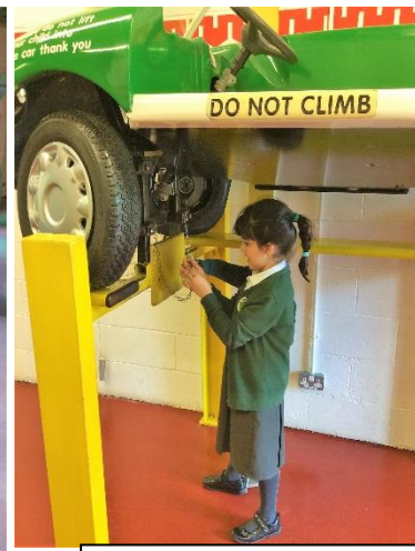
Amelia the mechanic