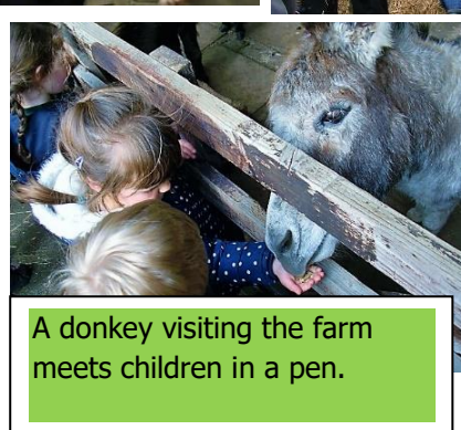
A donkey visiting the farm meets children in a pen.