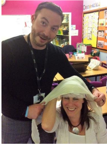
It's not a wedding veil but a cravat bandage!

Here at Hawksworth we invest in staff training because we want our pupils to be taught and cared for by the best trained staff. All of our staff are trained in first aid and when their First Aid certificates were due to expire after three years in October 2018, I decided to allocate a large percentage of our training budget to have these certificates renewed and have the teachers, teaching assistants and Kestrels staff to undergo rigorous accredited First Aid Training delivered by Paco First Aid . They spent eight hours training during the September Training Day and spent three hours after school on Tuesday evening and then will have to complete a further three hours next Tuesday evening.....followed by an exam! Paco First Aid Training commended our present procedures for First Aid within school – which was reassuring and a testament to our fantastic staff who are always willing to put the extra hours in so our pupils are well looked after.